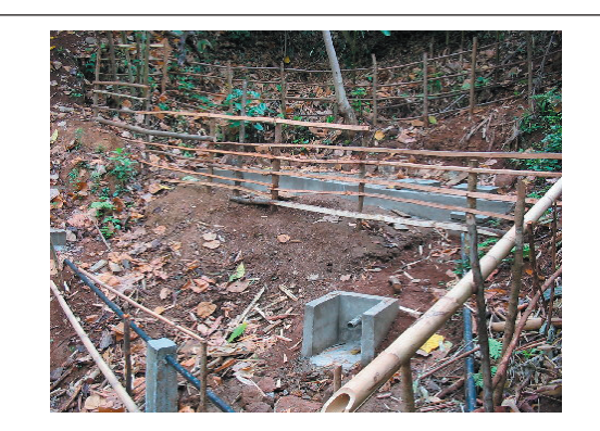
Photograph 1. Concrete intake and its overflow in Namhee Village (6 hrs walk from road access)