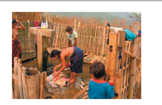
Photograph 4: Tapstand

When this water building activity is complemented with health education sessions (aiming at improving the awareness on water borne diseases and malaria prevention), qualitative surveys indicate that it has a real positive impact on morbidity reduction.