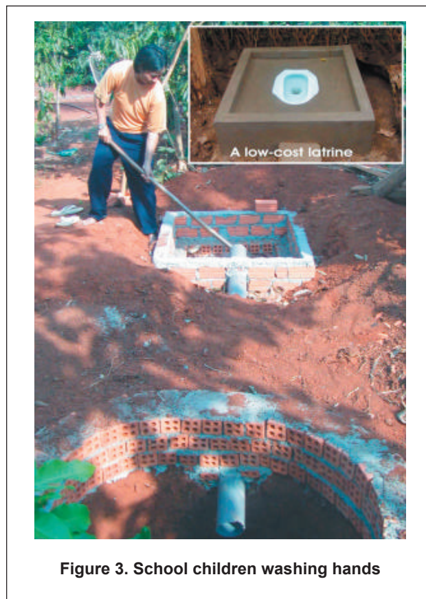
Figure 3. School children washing hands

In order to increase the population's awareness of hygiene and sanitation, the Project IEC has been carrying out the multimedia information campaign based on television, radio, billboards, models and poster presentations. Multi-media IEC materials on the activities of the Project in general and the on-site sanitation in particular have been produced. The IEC materials are based on the recommendations of the local perception survey, on the request from the two other programs of the Project, on the work progress of the construction work, and on the assessment made by the IEC Team on the need for more information on specific issues. The awareness activities have been directly implemented by the motivator network, which installs a trained person in each of the commune units. The 12 sanitation trainers em-