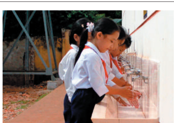
Figure 2. School children washing hands

across the 15 communes contained within the Project area, and were further distributed within the administrative units within each commune.