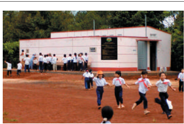
Figure 1. A typical school latrine

The private latrine program is an important component of the Project's On-Site Sanitation Program. Through this program, we significantly improved sanitary conditions at over 1,100 demonstration households located in the peri-urban areas of Buon Ma Thuot, outside of the new piped sewerage system. The improved sanitary facilities were distributed