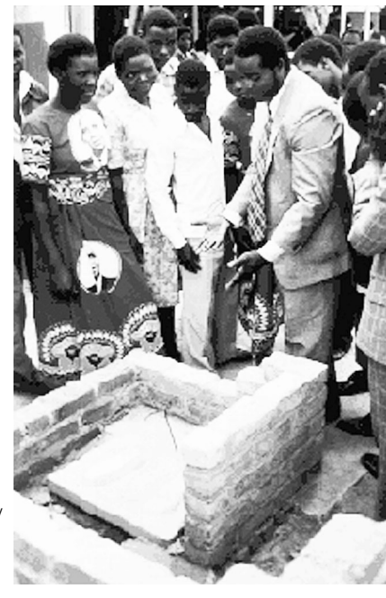
SanPlat 60x60 cm installed in a demonstration latrine at a Trade Fair in Mzuzu, Malawi. The small SanPlat 60x60 cm can easily be installed in any latrine. The example shows a VIP latrine under construction.

For more information about these moulds contact: LCS ProMotion Flo 18, 46796 Grästorp, Sweden. Tel +46 514 40058, fax +46-514-40273 E-mail: lcs@sanplat.com www.sanplat.com