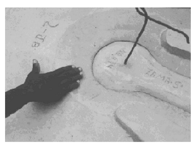
Appropriate moulds, manuals and training give ideal dimensions and hygienic surfaces