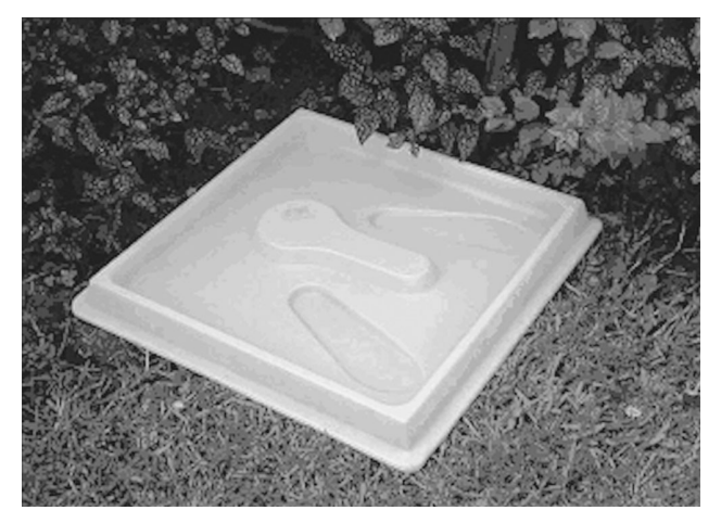
The all-in-one SanPlat Mould 60x60 cm The ideal mould for making SanPlats 60x60 cm. For best results with minimal training.