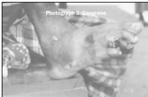
Photograph 3. Gangrene

Over exploitation of groundwater for irrigation purposes is becoming very common in developing countries, like Bangladesh, India and China. Millions are exposed to arsenic poisoning and suffering from arsenicosis from drinking contaminated groundwater. Over exploitation of groundwater unjudiciously caused this grave situation. The arsenic poisoning, a world's worst episode, may aggravate if appropriate measures are not taken to halt its spread. Any country where water withdrawal goes similarly unchecked could leave themselves open to similar calamity. We can not exploit natural resource recklessly. To combat the situation, we need urgent watershed management and awareness campaigns at grassroots level.