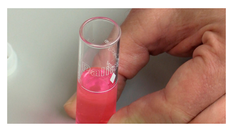
Figure 9. Water with a high concentration of chlorine

The chemical used for this test produces a colour change if chlorine is present, and the amount by which the water changes colour depends on the chlorine concentration