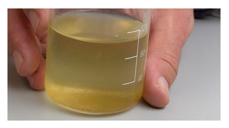
Figure 18. A sample of water containing iron

that that it is limited to an acceptable concentration. Figure 18 shows a water sample containing a high concentration of iron. You can just see the suspended particles at the bottom of the sample as they settle.