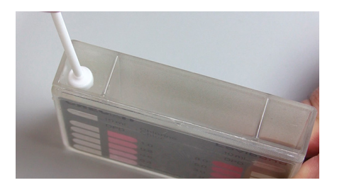
Figure 6. Crushing the tablet

Pour a little water into the left hand chamber and crush the tablet with a sterilized plastic spatula. Put the comparator on a firm surface so that you don't push the bottom out (Figure 6).