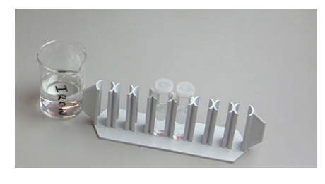
Figure 20. Two test tubes