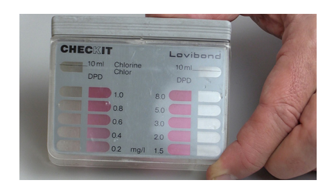
Figure 1. A comparator

As chlorine concentrations in water reduce over time, it is important to check concentrations of chlorine in drinking water periodically. The quickest and simplest method for testing chlorine concentrations is an indicator test, using a comparator (Figure 1). For this method, a tablet of chemical reagent is added to a sample of water,