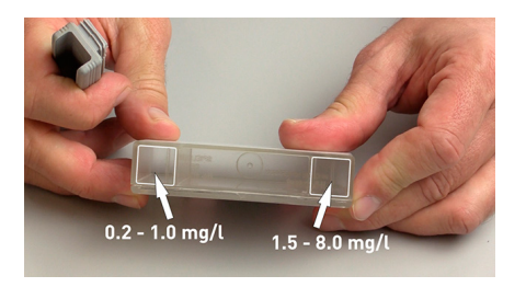
Figure 3. The three chambers of the comparator

for measuring 0.2 to 1.0 milligrams of chlorine per litre. The chamber on the right is for measuring 1.5 to 8.0 milligrams per litre. The central chamber is used for a control test.