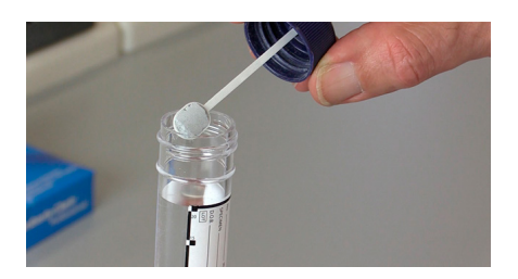
Figure 12. Adding the nitrate powder