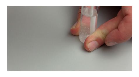
Figure 21. The tablets are added and crushed

The two crushed tablets react in the water and it is immediately possible to see that the colour changes. The extent of the change to the colour depends on