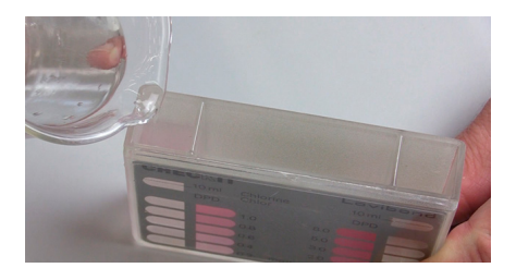
Figure 7. Topping up the chamber

As it is outside the colour range on the scale we know that this sample has less than 0.2 milligrams per litre (Figure 8).