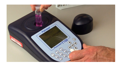
Figure 15. Inserting the test tube into the photometer

Then press the 'OK' button again. The display now asks you to insert the test sample, so take the blank out, wipe the outside of the sample test tube to ensure it is clean, place it into the photometer with the diamond mark pointing towards you, and press 'OK'.