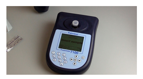
Figure 10. A photometer

By comparing the colour against a reference colour, the chlorine concentration can be determined.