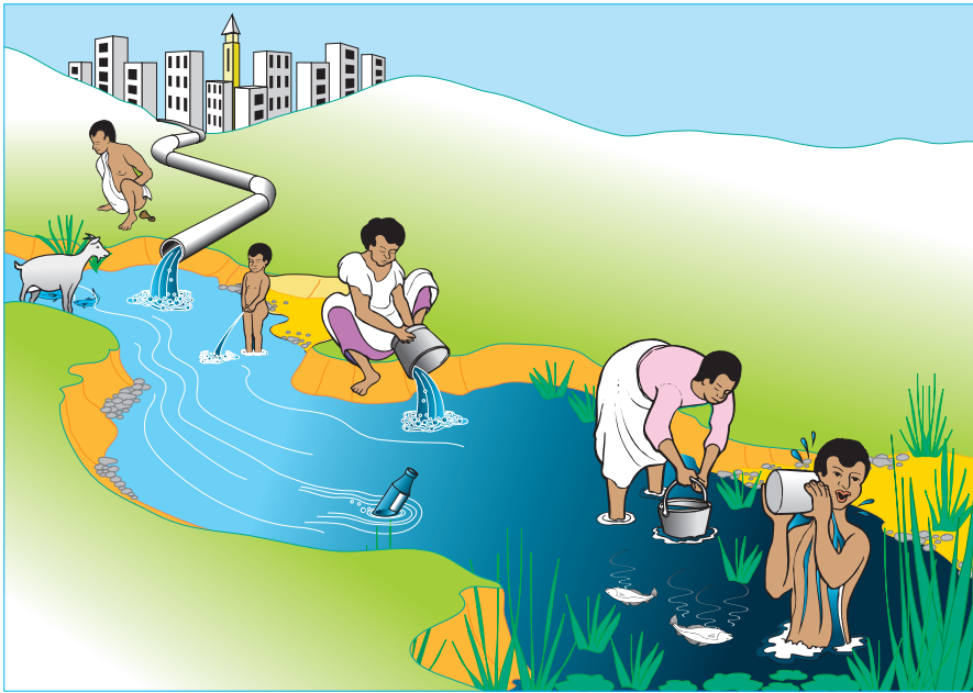
Figure 2. This picture shows a woman collecting water from a stream which could be polluted by human excreta and urine, animal and domestic wastes, soaps and detergents, pesticides and fertilisers.